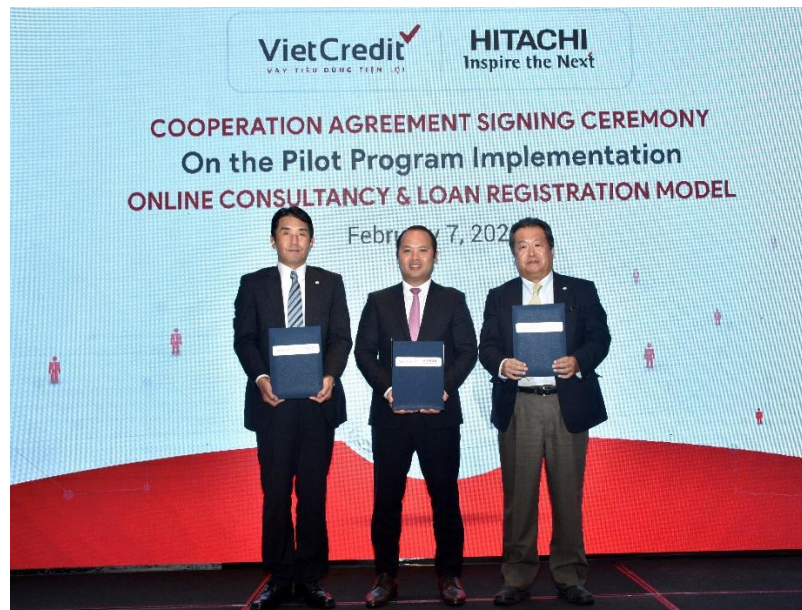
The launch ceremony

Verifying effectiveness to introduce an automatic loan contract service on tablets and a loan screening service using AI