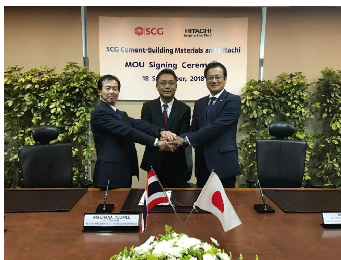
MOU Signing Ceremony

Bangkok, September 18, 2018 --- Hitachi, Ltd. (TSE: 6501, “Hitachi”), Hitachi Asia (Thailand) Co., Ltd. (“Hitachi Asia (Thailand)”) and SCG Cement-Building Materials Co., Ltd. (“SCG-CBM”) today announced the conclusion of a Memorandum of Understanding (“MOU”) concerning collaborative creation to promote energy saving across SCG-CBM factories and increase efficiency in dispatching process.