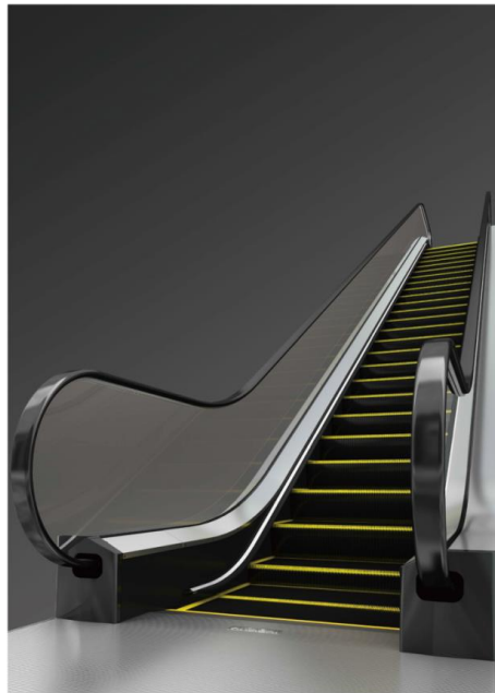
External appearance of the new TX Series escalator