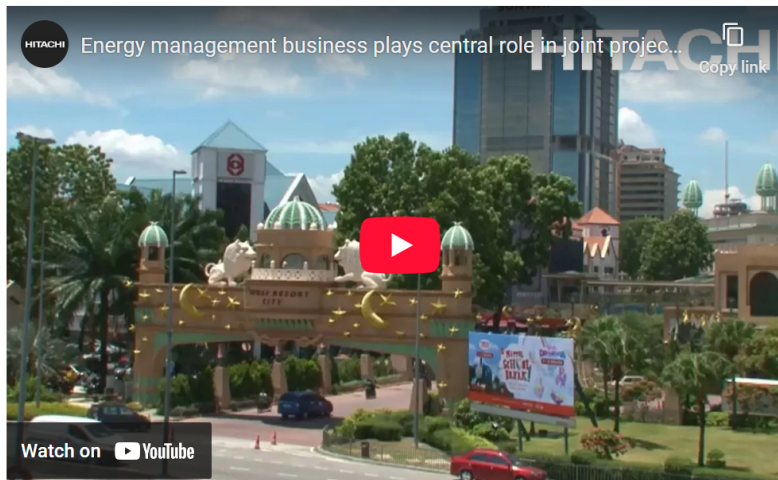
Video: Energy management business plays central role in joint project

Hitachi is currently planning an energy-saving project for a university and a college, hotels, a hospital, a shopping mall, and other facilities owned by the Sunway Group, a company involved in a wide range of businesses revolving around urban development. As a first step in this project, Hitachi has performed an energy conservation demonstration study at the Sunway's headquarters building. By addressing a wide range of challenges in partnership with the Sunway Group, Hitachi is committed to contributing to urban development in Malaysia well into the future.